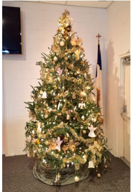
Christmas Tree in Chapel