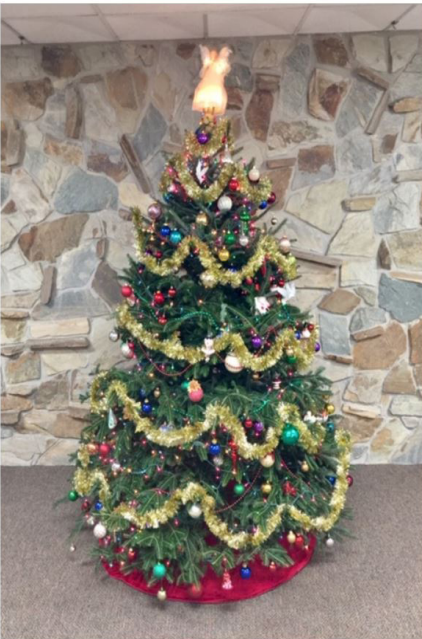
Christmas Tree in Lobby