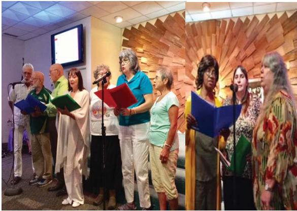
Temple Choir sings "Stand By Me"